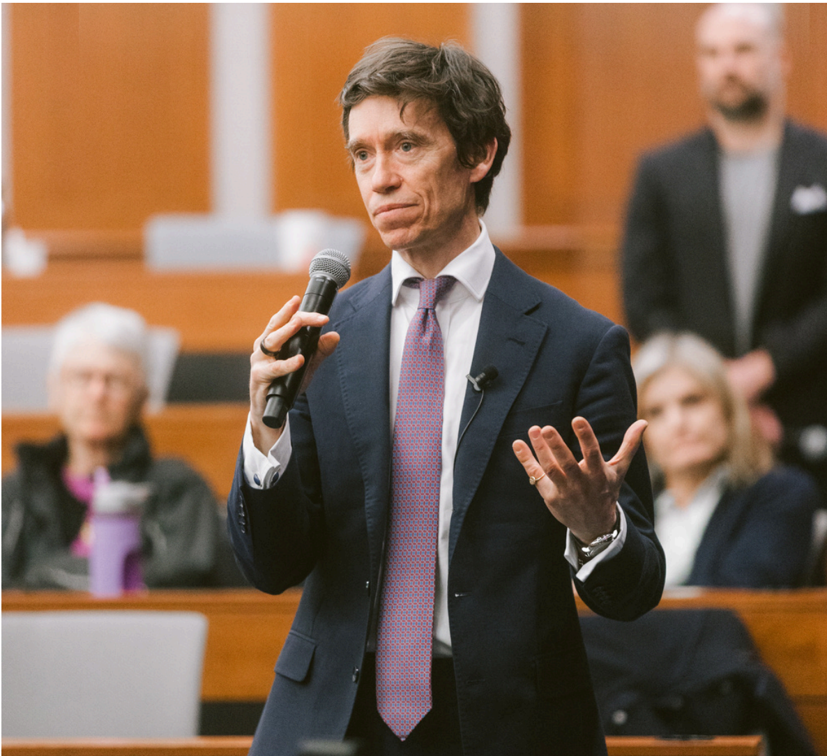
2025 Kruzal Lecturer Rt Hon Rory Stewart OBE